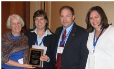
Virginia Tech accepts SACES Program Award

The SACES 2008 Conference was held in Houston, TX at the Hilton Post-Oak was another successful conference in terms of attendance and the